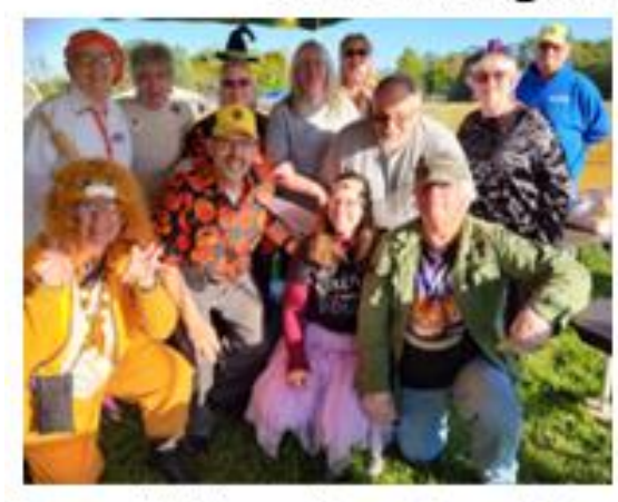
We served hot dogs, chips, water, and hot apple cider to families at the Haven Hallow Fest.