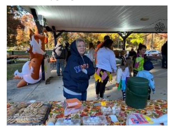
Under the Pavillon