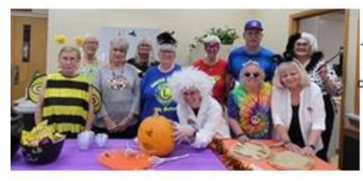
The South Haven Lions served a free spooky themed meal at a community dinner at Portage First Methodist Church. We also played three card bingo with attendees.