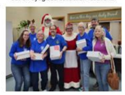
South Haven Lion members helped fill shoe boxes for Project Operation Christmas Child. These boxes will be given to children in need.