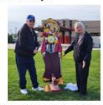
Lion Larry was setup at a Subaru Pet Adoption event. Information was handed out on eyeglass collection locations.