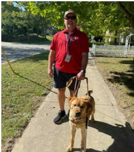
Me and Tucker on our