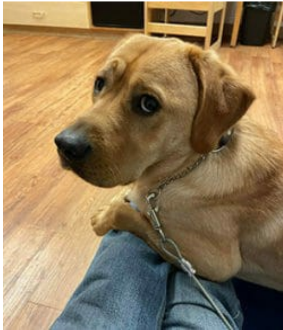
Tucker says, “Can I play now?”

Well, just like in all areas of life and learning, there are ups and downs. Today started on a down. And honestly I blame myself more than Tucker. Park time isn’t until 6:30 a.m. I wanted to go get a cup of coffee at about 5:50 and didn’t want to leave him behind. So off we went, and... he decided to “park” in the front office. It’s happened with other dogs I’m sure, just hate that it happened. So going forward, as soon as we both wake up, we don’t have to wait until scheduled park time anymore.