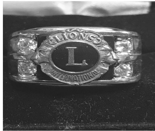
Custom made Lions Ring ( men size 12 )

Raffle Tickets only $10.00 each ( only 1000 to be sold )