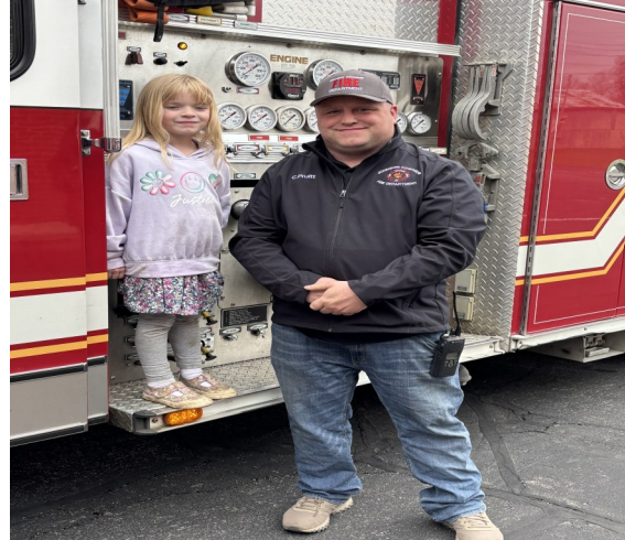
Fire Truck Ride