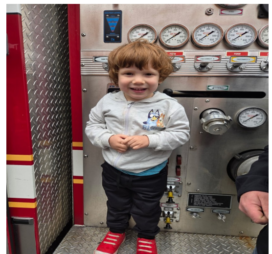
Fire Truck Ride