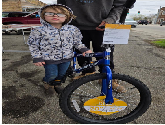
Little Boys Bike