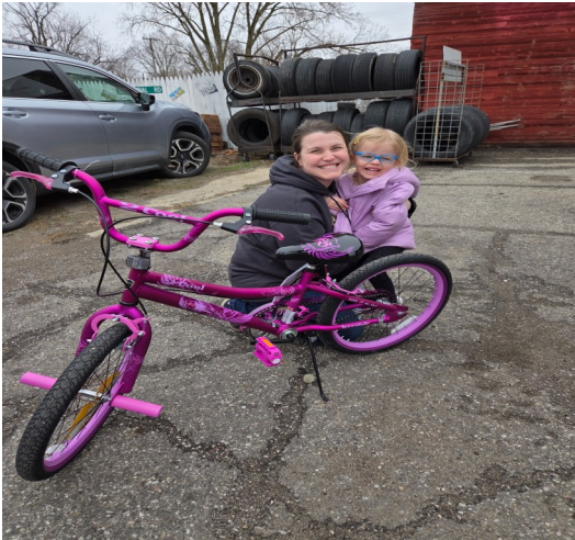
Little Girls Bike