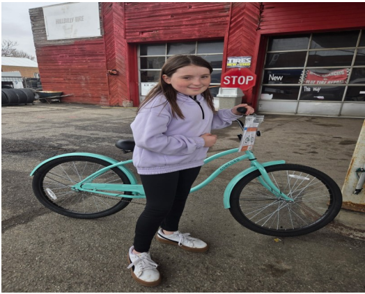
Big Girls Bike