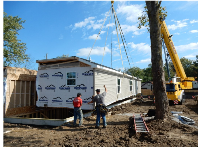
The new Goal Ball Homes being set at Turnstone.