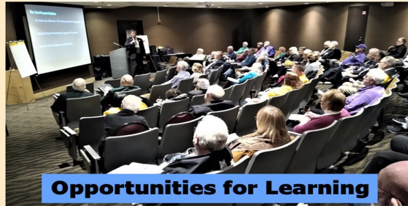
Opportunities for Learning

It's not too early to start planning for 2024. Mark your calendar now for the 2024 Mid-Winter Conference.