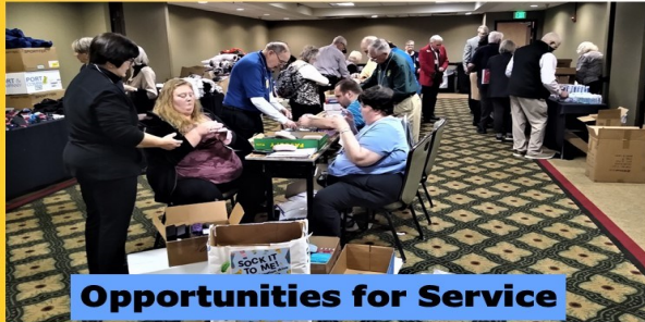
Opportunities for Service

It's not too early to start planning for 2024. Mark your calendar now for the 2024 Mid-Winter Conference.