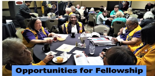
Opportunities for Fellowship

Crowne Plaza Indianapolis Airport January 19-20, 2024