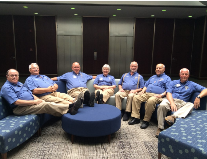
The Indiana Lions Council of Governors relaxing while visiting the offices of Lions Clubs International.