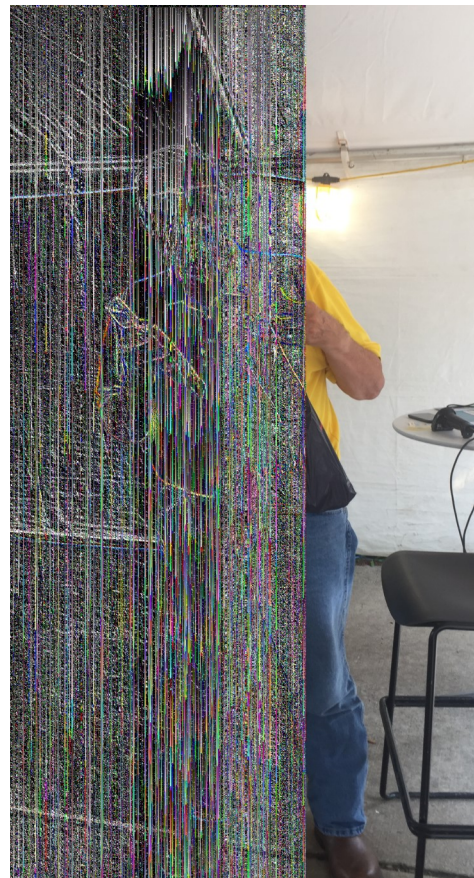
PDG Roger Cash received used eye-glasses while working at the state fair.