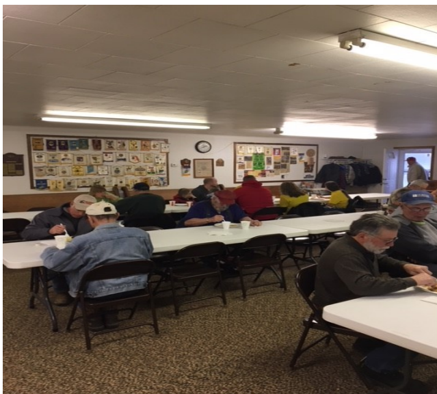
(Above) Young America Lions Club held a pancake breakfast March 17. Looks like several people really enjoyed those hot cakes!

(Right) Have you LOOKED at your road side signs lately?