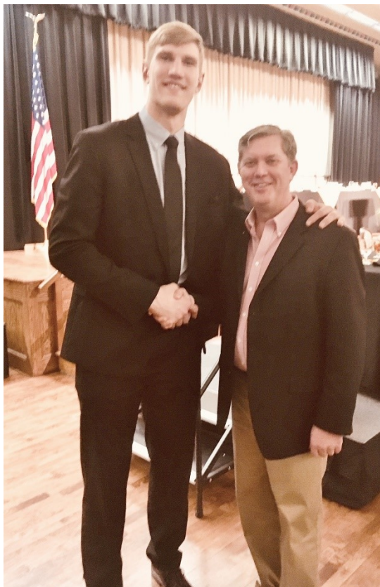
Lions District 25C Newsletter

Anyone is invited to attend a District Governor Visit. The interaction is good for all. Just contact the club and let them know you are coming.