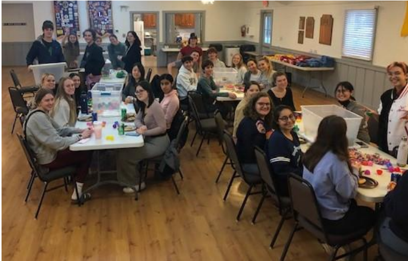
Zionsville Leo's meet to start stuffing some of the 22,000 eggs for the Egg-normous Egg Hunt in Lions Park on April 16 th !