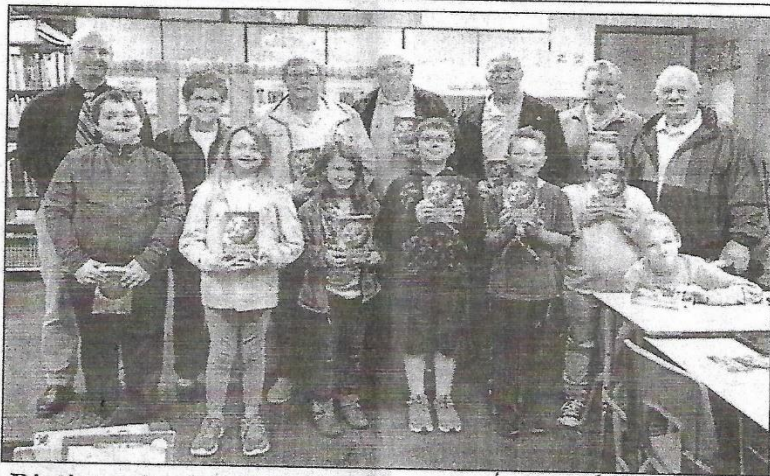
THE DAILY CLINTONIAN, CLINTON, INDIANA