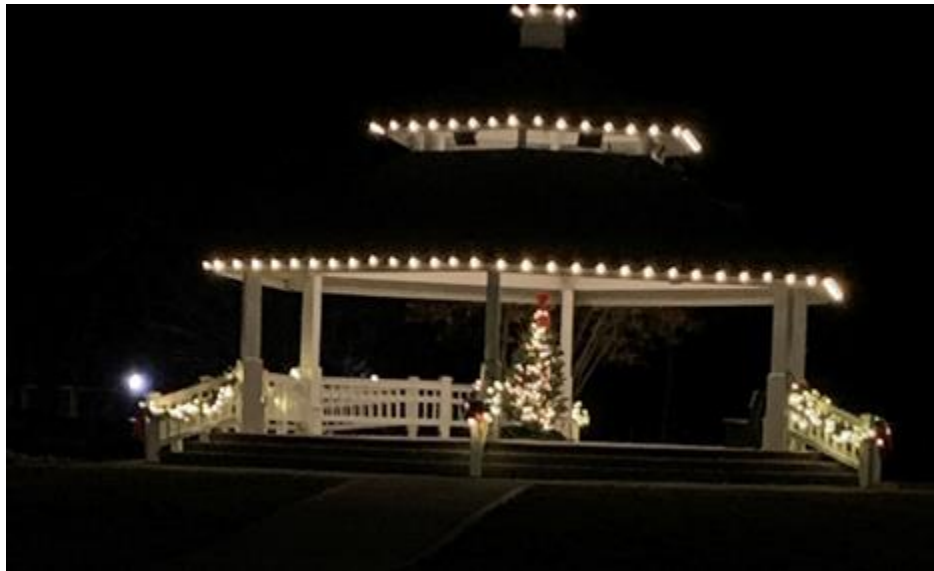
HAPPY NEW YEAR to all Lions and their families from the Zionsville Lions Club.