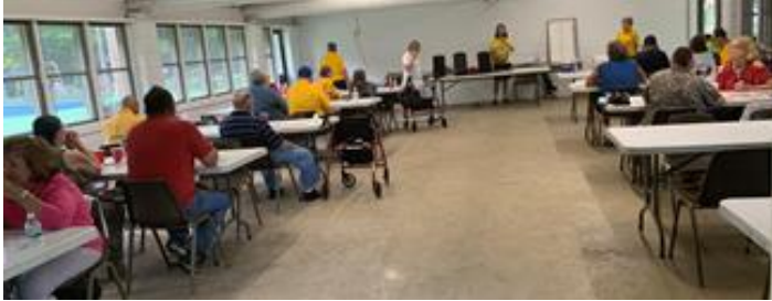
Zionsville Lions Club’s Senior Committee had their 1st Senior Bingo in the Shelter house in Zionsville Lions Park. The committee is finding ways to share Lions Park with seniors in the community.