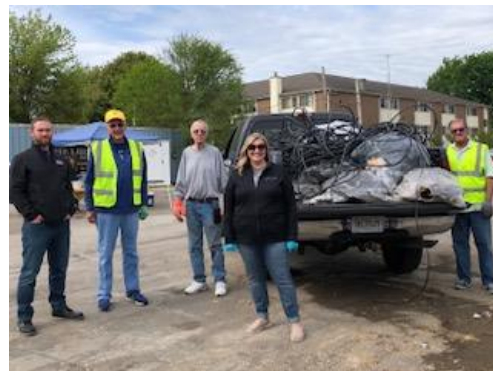
The Riley Township Lions Club participated in the Terre Haute Clean Up. Here some of the workers are shown with just one truckload of their work.