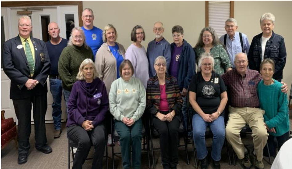
Brazil/Poland Lions Club visit.