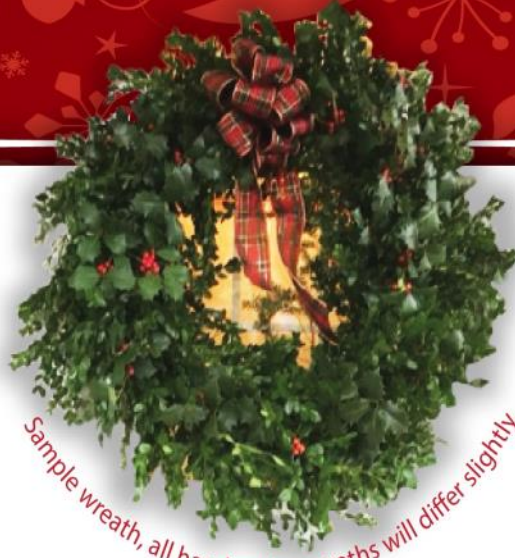
Sample wreath, all handmade, wreaths will differ slightly.