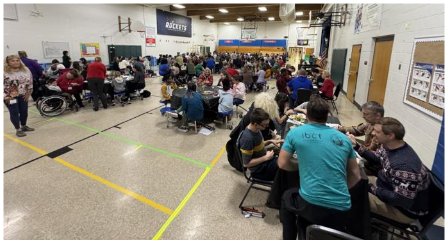
Indiana School for the Blind and Visually Impaired Trustees assisted with serving 175 persons at annual Christmas Luncheon