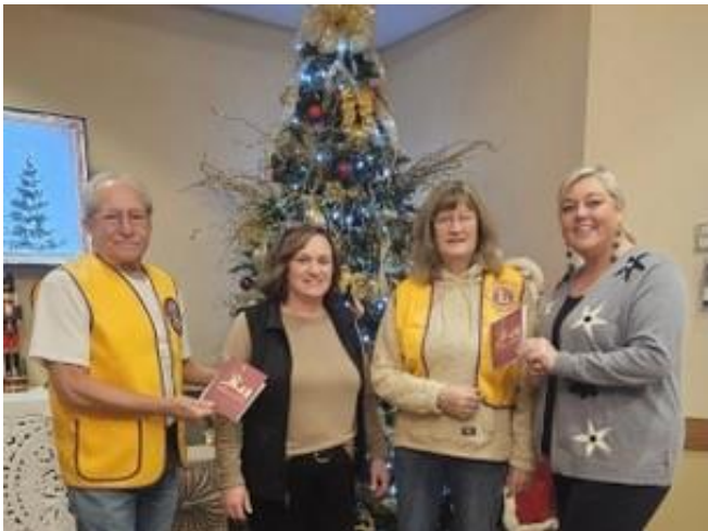
Plainfield Lions Club Spread Cheer by Delivering Christmas Cards

Plainfield Lions Club members believe it is important to spread Christmas cheer. For several decades the Plainfield Lions have given Christmas cards to Plainfield’s nursing home residents during the holidays. Last year, the Lions passed out 594 cards. This year, over 700 residents residing at Plainfield Health Care Center, Cumberland Trace, Sugar Grove Senior Living, Glasswater Creek of Plainfield, and The Oaks at Plainfield received Christmas cards from members of the club.