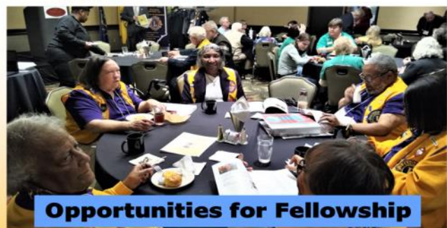
Opportunities for Fellowship

Crowne Plaza Indianapolis Airport January 17-18, 2025