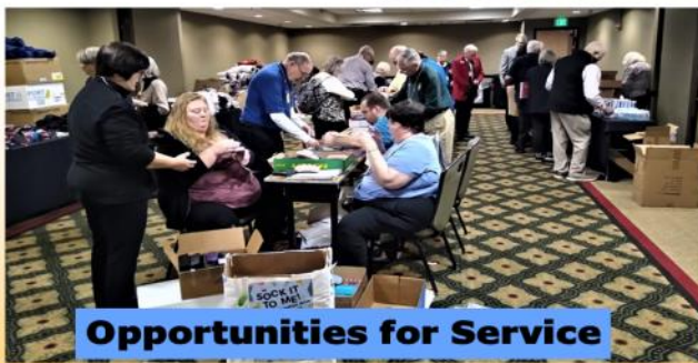
Opportunities for Service

It's not too early to start planning for 2025. Mark your calendar now for the 2025 Mid-Winter Conference.