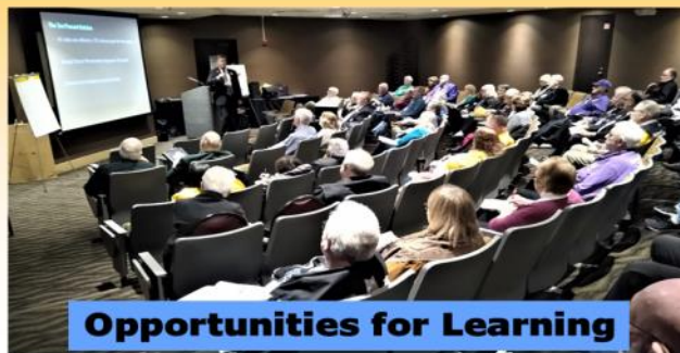
Opportunities for Learning

It's not too early to start planning for 2025. Mark your calendar now for the 2025 Mid-Winter Conference.