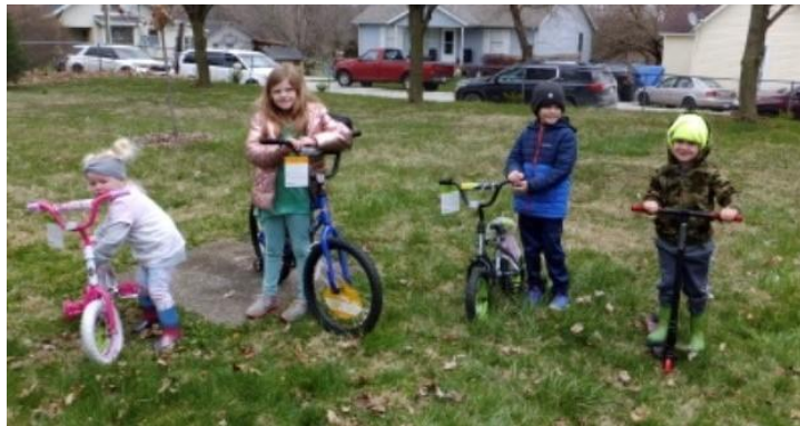
There were 4 top winners in 4 age groups for a new bike or scooter! Smiles all around at Poland Lions Park.