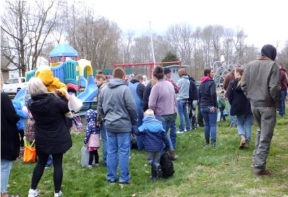
Here is just a portion of the crowd that hopped to the Poland Lions Club Park for a chilly but fun Egg Hunt!