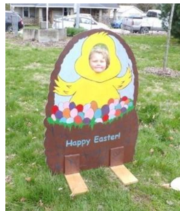
Talk about a good egg! This Sweetie had her picture taken before the Poland Lions Club Easter Egg Hunt. Other cutouts included different sized bunnies—lots of talented Lions in that club!