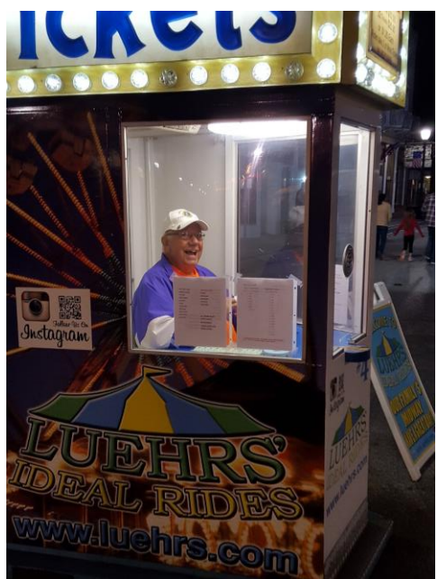
Martinsville Noon Lions Club