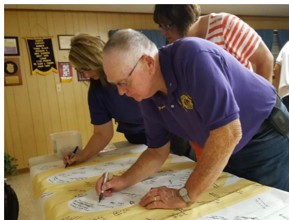
New Goshen West Vigo Lions Club