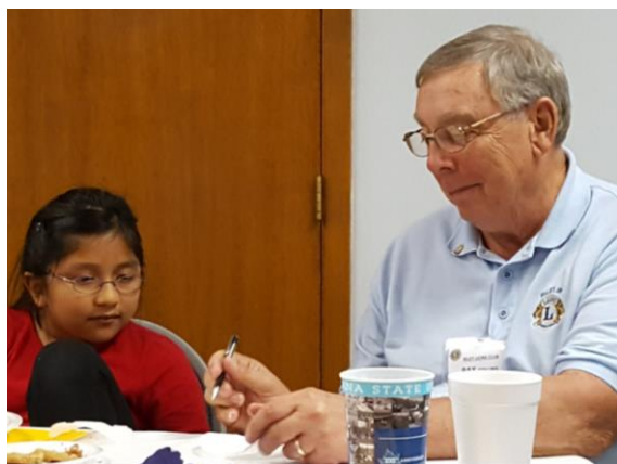
Riley Township Lions Club