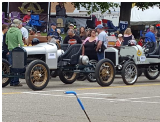
2016 Newport Antique Auto Hill Climb - Newport Lions Club