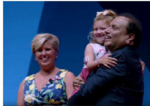
the little girl, with Type 1 Diabetes that inspired so many at the Lions International Convention in Las Vegas, NV.

DOOR PRIZES + FUN SPEAKERS and FELLOWSHIP! Bring a Non-Lion and win an extra chance for a great door prize!