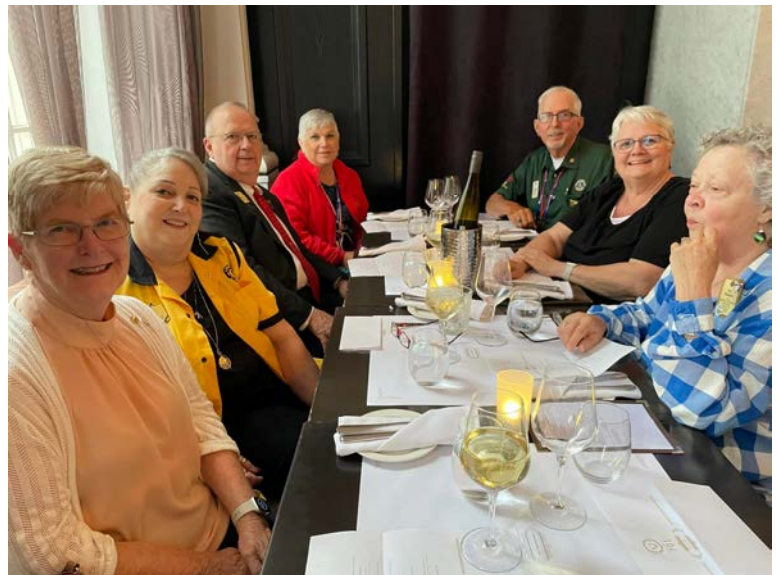
Indiana Delegation enjoying each others company while in Montreal