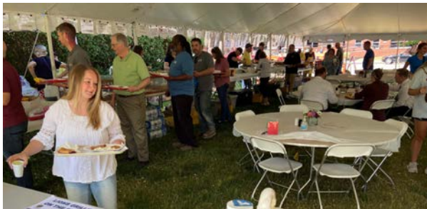
Lunch crowd lining up for treats