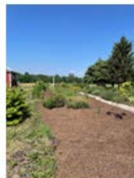
Teter Farm Peace Garden