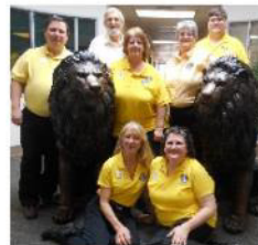
Best MD 25 Governors Ever!