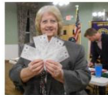
Receiving Donations for State Projects