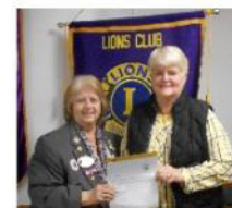
Presenting Chevrons for Years of Service