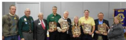
Presenting W.P. Woods Fellowship Awards