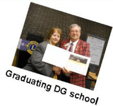
Graduating DG school