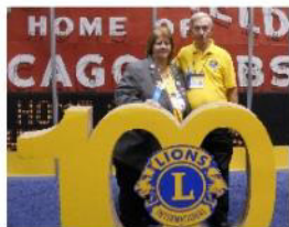
Int'l Convention Chicago - 2017