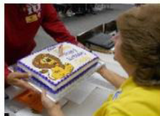
Even a Birthday Cake