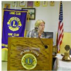
1st Cabinet Meeting