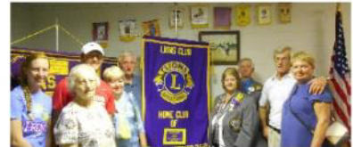
Banner Night Honored by Family Support