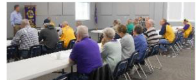
District Eye Screening Training