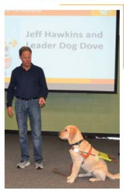
Leader Dogs for the Blind | 1039 S Rochester Rd | Rochester Hills, MI 48307