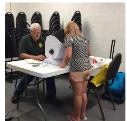
Sullivan County Back to School Bash - Dugger Lions Club - Vision Screening