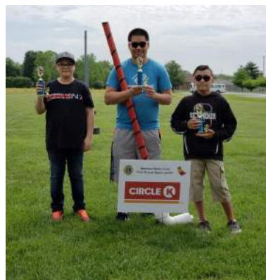
1st annual Spud Launch winners: Team Seymour Boys and Girls Club