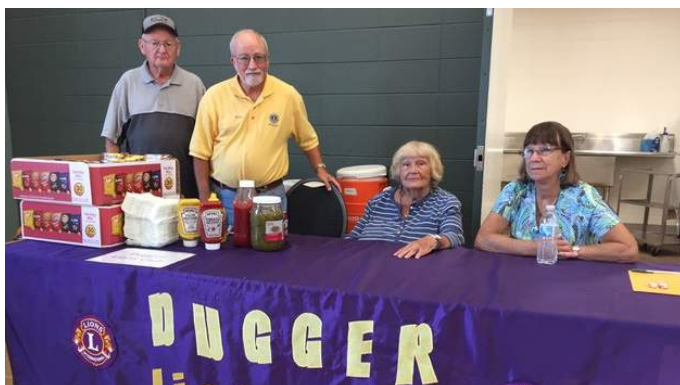
Sullivan County Back to School Bash - Dugger Lions Club served food to approximately 200 students and performed vision screenings on 52 students.