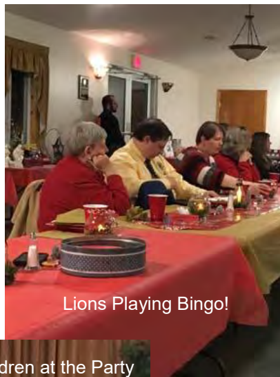
Lions Playing Bingo!