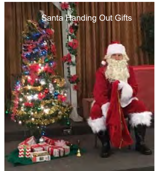
Santa Handing Out Gifts