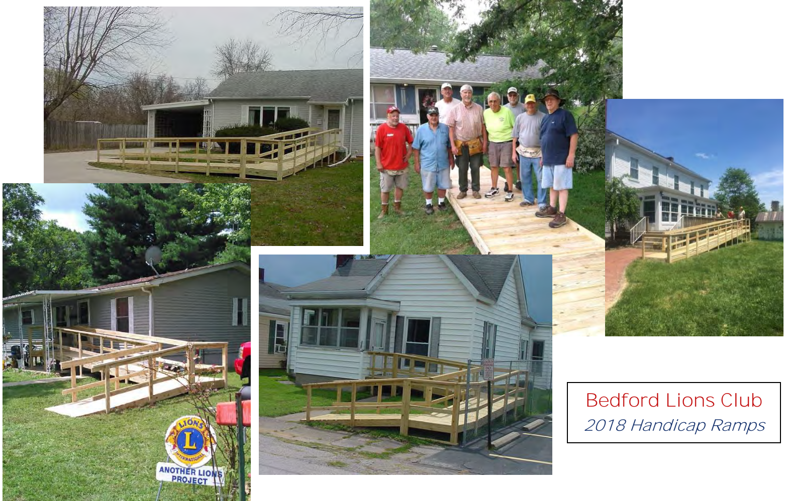
Bedford Lions Club 2018 Handicap Ramps

The Bedford Lions Club ramp building crew with the help of two members of the Fayetteville Lions Club built 19 ramps including one in Medora and one in Mitchell this past year varying in length from 6 Ft to 56 Ft. They volunteered a total of 679 hours working building these ramps during the months from March to October. The Bedford Lions Club has now built a total of 230 ramps since they started this great project in 1989. The photos above are from this year's ramps and are examples of the Lions building skills and their service to the community.