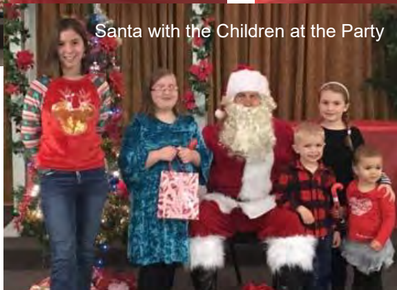
Santa with the Children at the Party