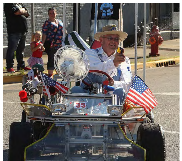
Bedford Lions Club Limestone Heritage Festival Parade