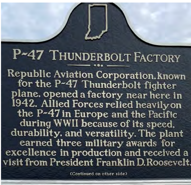
Left: The replacement P47 historic marker for the sign that was stolen. The new sign is located at the Evansville Wartime Museum.