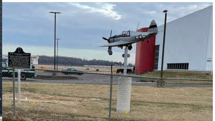
Below: Location of the sign at the Evansville Wartime Museum