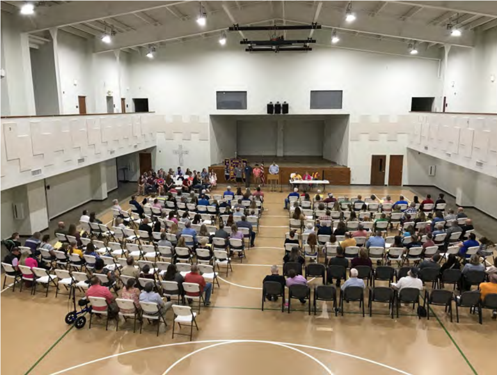
Left: Photo shows Youth Appreciation Program setup with kids and presenters in front and families and Lions seated in the back of room