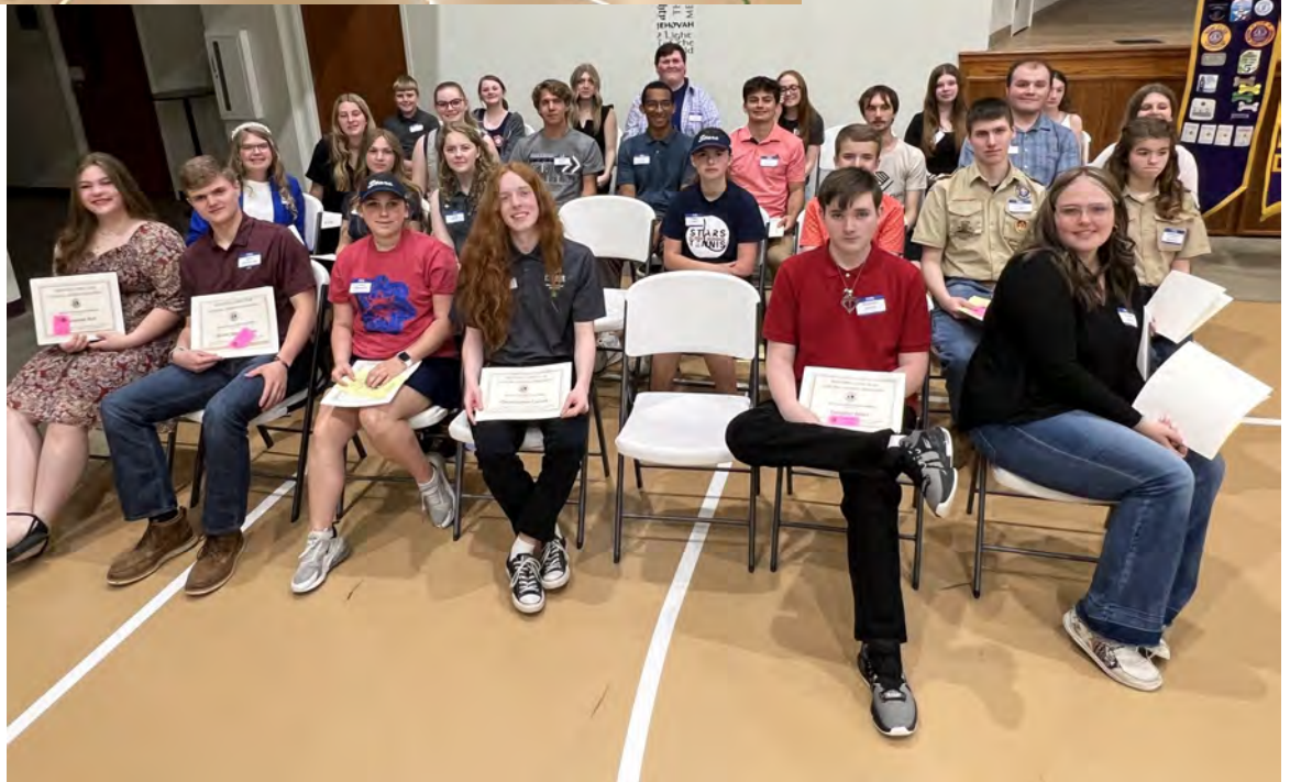
Below: Photo shows the great kids honored by the Bedford Lions Club