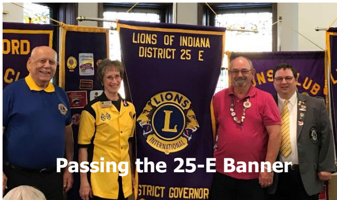
Passing the 25-E Banner