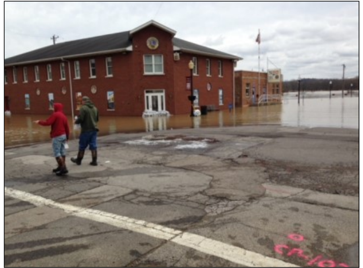
Aurora Lions Club Clubhouse before and after flooding