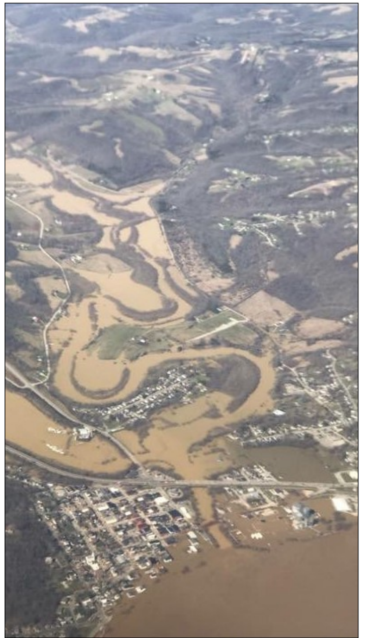
The Oxbow at 1465 at the Rte 50-GreendaleLawrenceburgExit