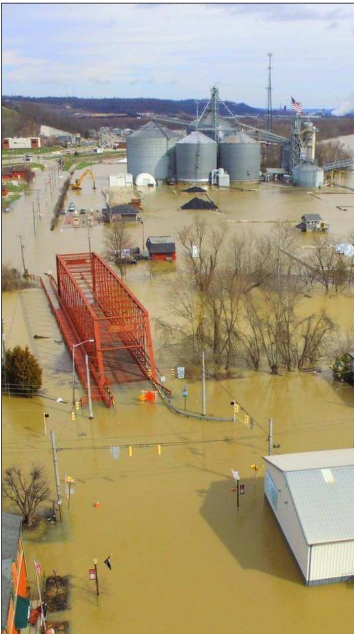
Overview of the bridge on 56 in to Downtown Aurora