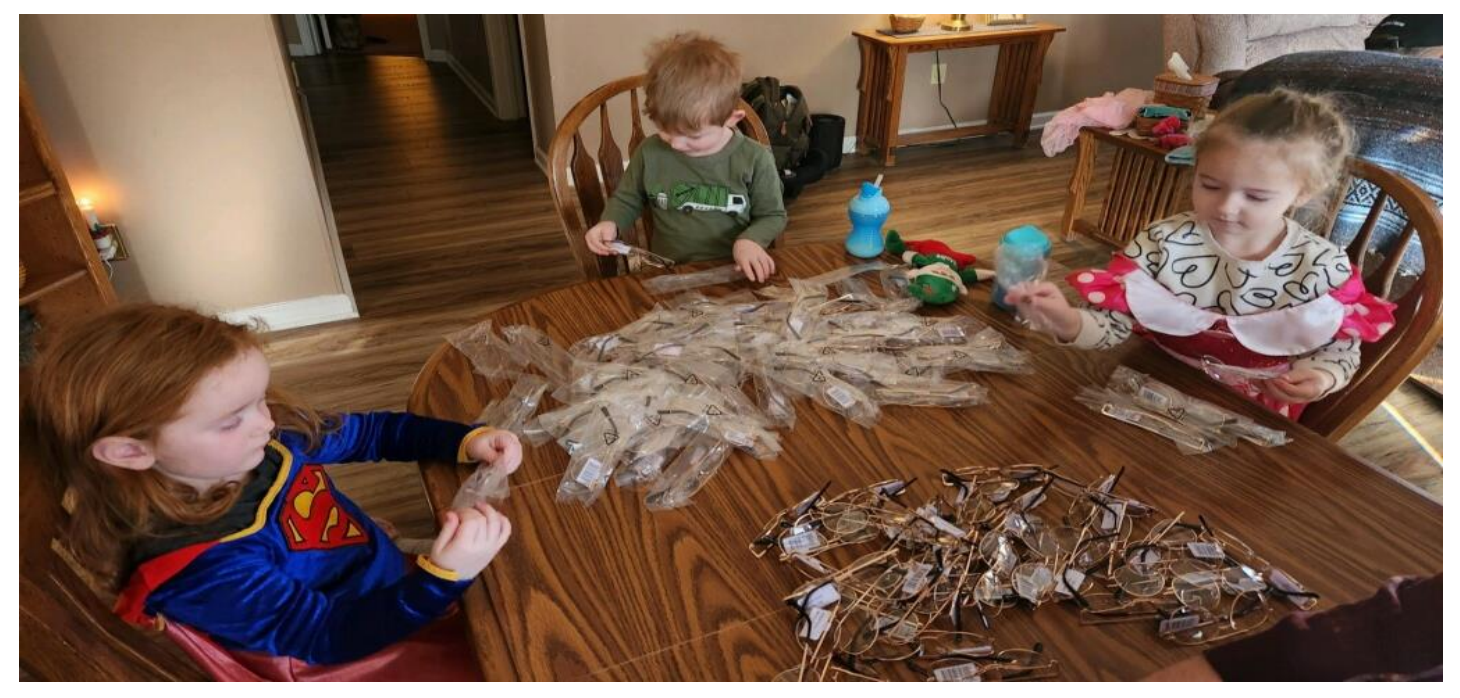
(Above) Future Lions sorting glasses.