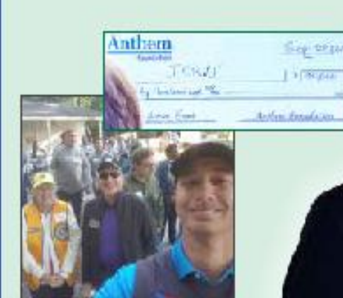
q at a Lions/Anth ership program.