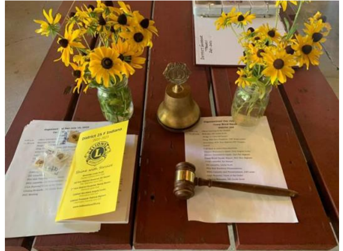
DG Linda all set up for Org Day!