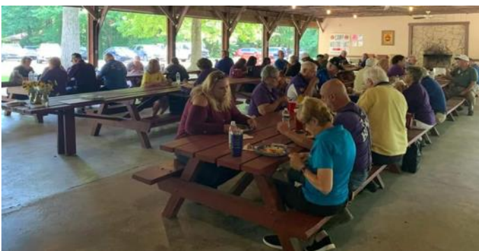
District 25F Lions enjoying a wonderful lunch at Org Day!