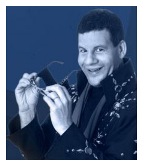
rotten (his words) prizes.

The committee also moved the venue to the Crowne Plaza Hotel & Conference Center, located at the Indianapolis International Airport. All activities will be inside this facility, making it easy for attendees to park and remain there for both Friday and Saturday activities. Changes in fees at the public schools in Plainfield would have increased our fees substantially to use those facilities, plus the meeting rooms and conference areas at the Crowne Plaza are much more accommodating and comfortable for attendees.