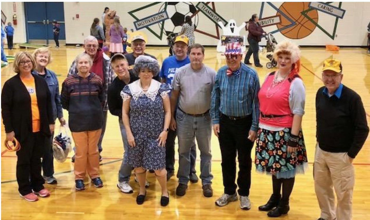
Centerville Lions Club members helping with the Halloween party.