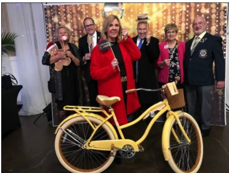
Lions in action at the Diabetes Youth Foundation of Indiana Gala November 9th: