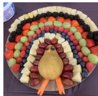
Cute turkey who was at the Indianapolis-Chapel Hill Lions