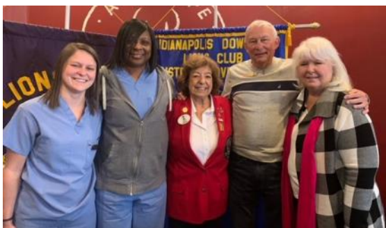
Fun with the Indianapolis-Downtown Lions