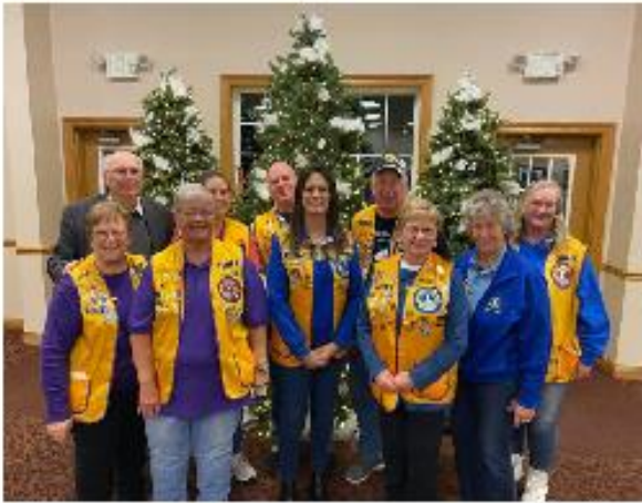
Milan Lions volunteering at the Winter Special Olympics