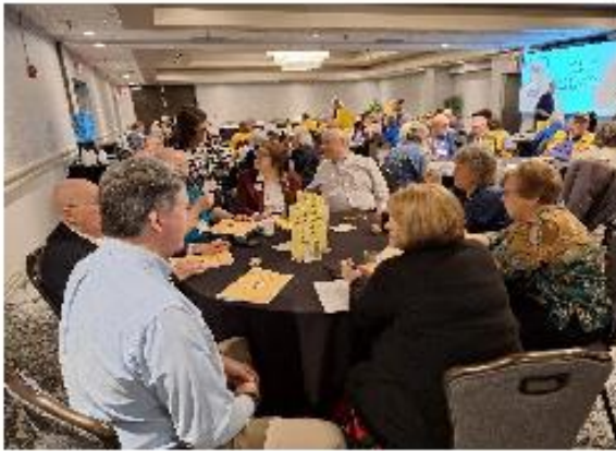
Full house at the Mid- Winter Conference!