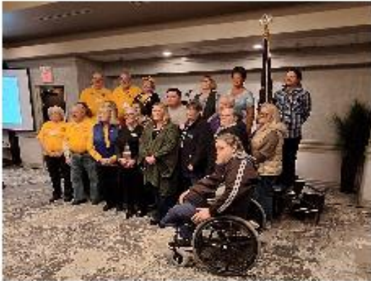
First time attendees at the Mid-Winter Conference.