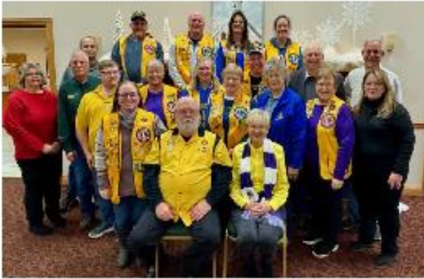
Indiana Lions Proudly Serving!