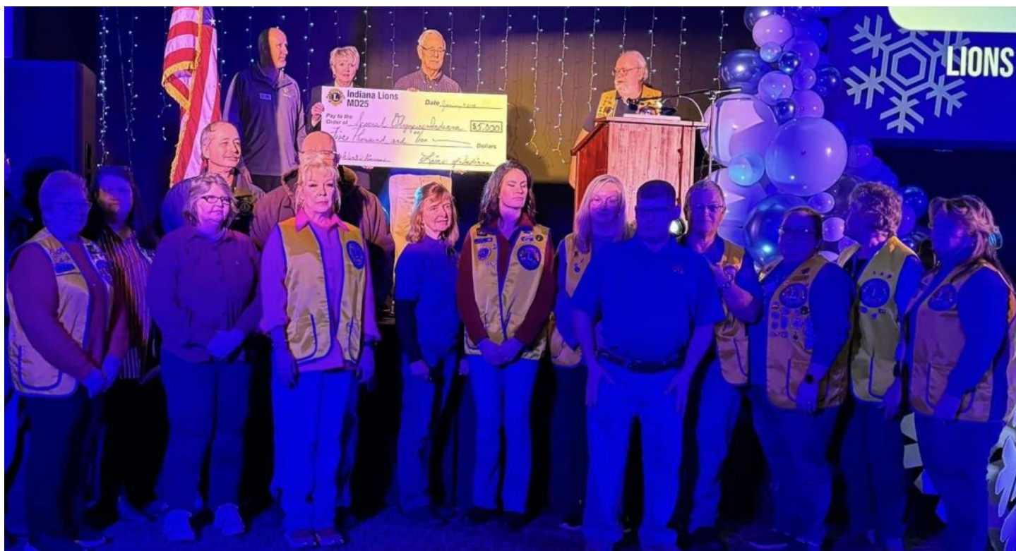
Presentation of Check from Lions of Indiana at Opening Ceremony for Winter Special Olympics.