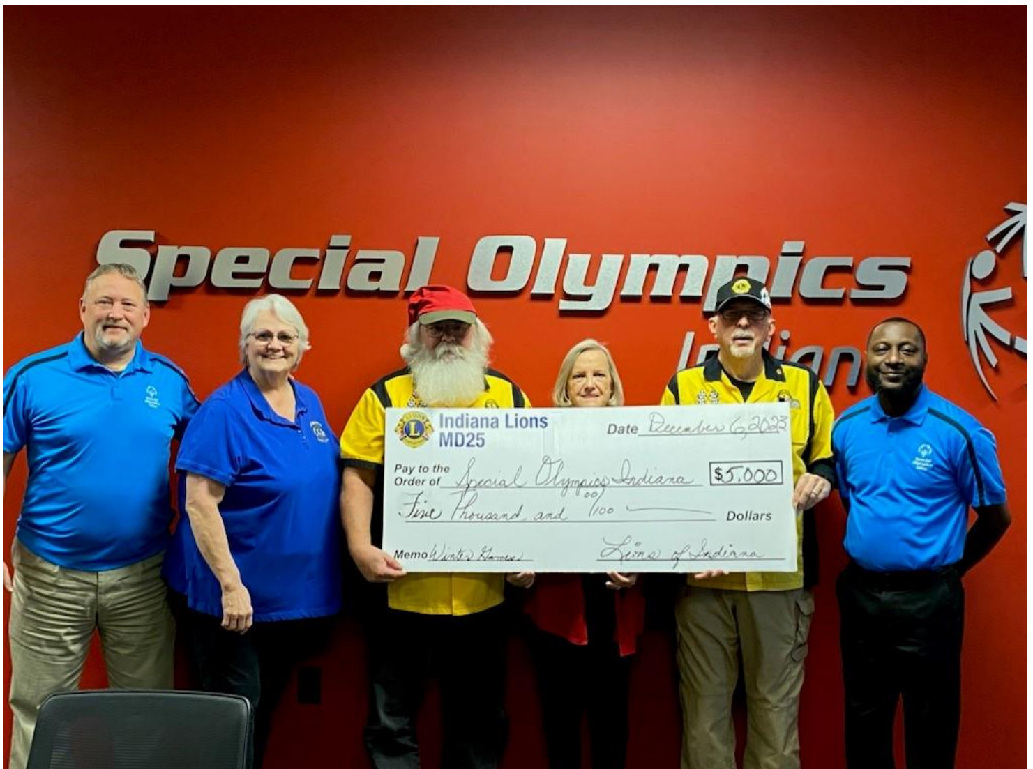
Presentation of Check from Lions of Indiana to Special Olympics on Dec. 6, 2023.