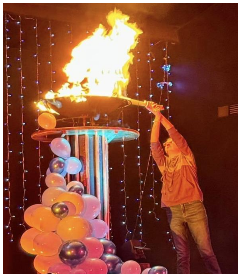
L: Special Olympic Athlete lights the Olympic Flame at the Opening Ceremony on Jan. 7th.