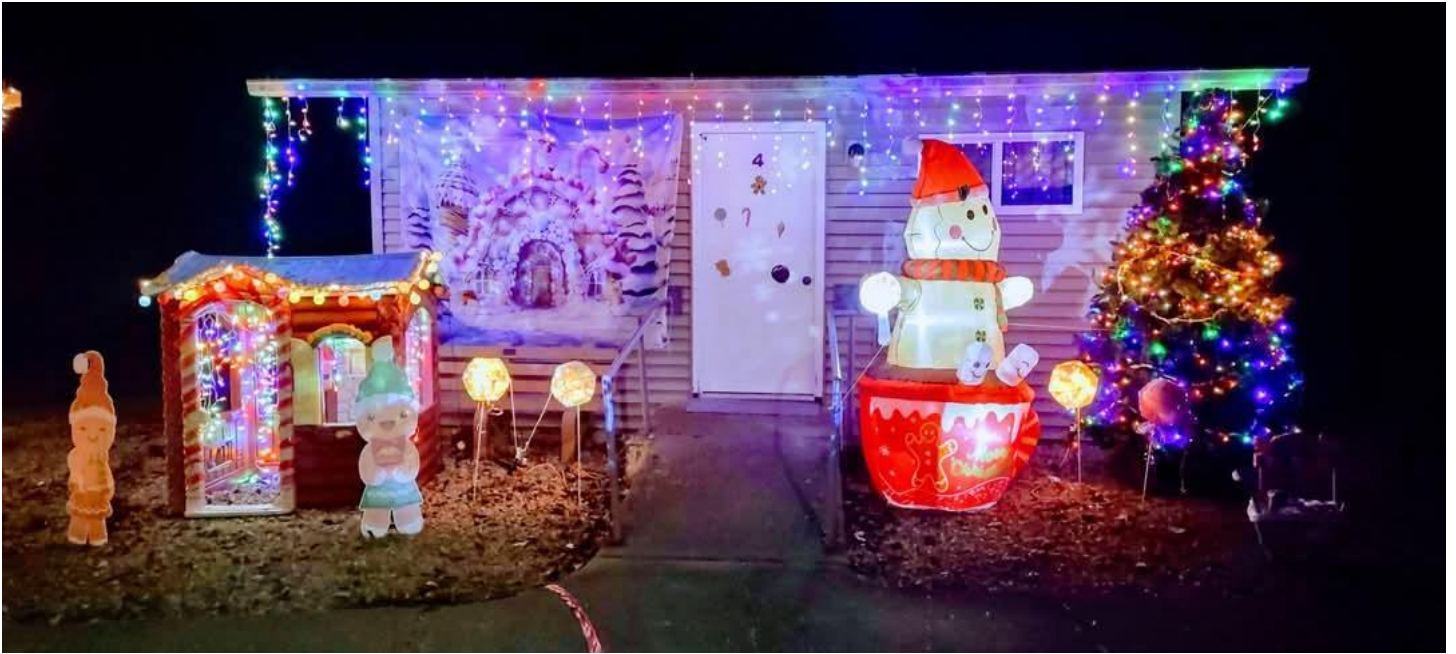
Camp Woodsmoke Cabin Christmas Decoration contest winner. Cabin #4 who is sponsored by the Ripley County Lions Clubs, Milan, Osgood, Versailles & Batesville.