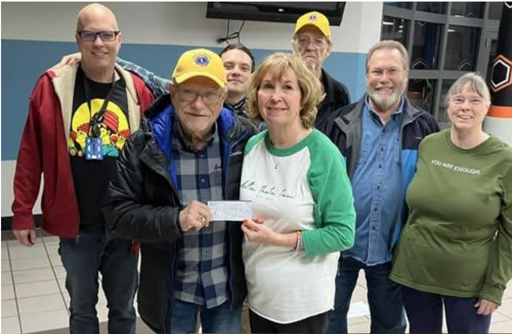
Delta Theta Tau presents a check to Beech Grove Lions.