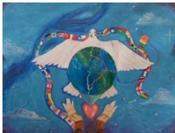
A beautiful Peace Poster Contest submission