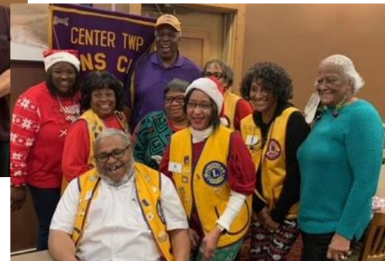
It was a fun evening with the Indianapolis Center Twp and Lawrence Lions!