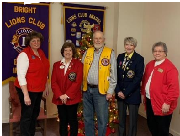
A very Christmasy Meeting in Bright! What great service they are doing!