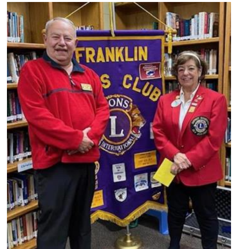
A great time with the Franklin Lions Club