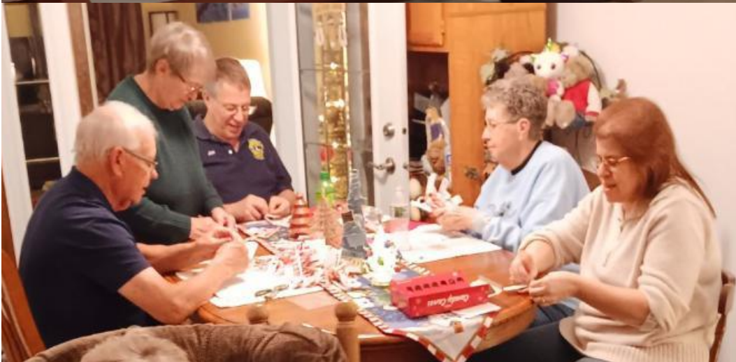
Williamsburg Lions club members assemble candy cane thank you's for the pancake breakfast patrons for their support.