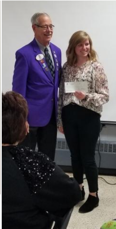
IU student from 25F receives scholarship from Speech and Hearing during their annual luncheon.