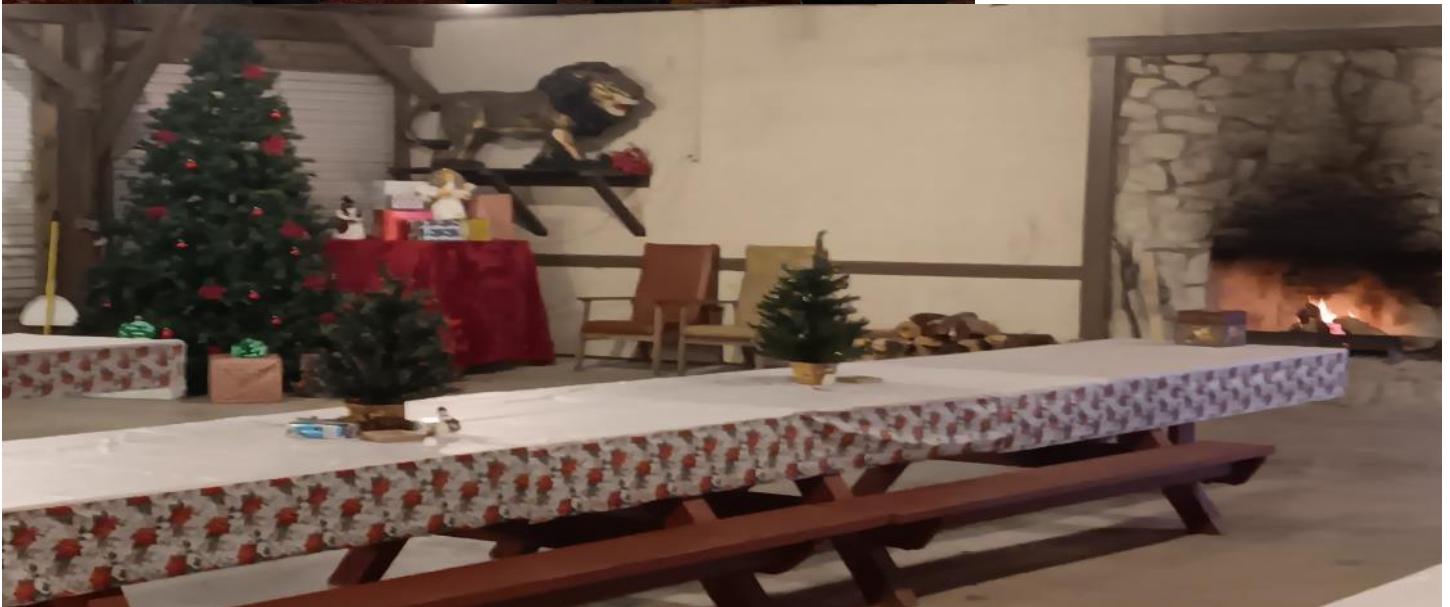
Camp Woodsmoke shelter decked out and ready for visitors to see the Christmas light display and enjoy a cup of hot chocolate by the fire.