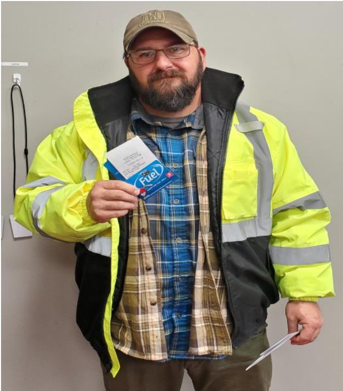
Father of young man dealing with bone cancer receives a $150 gas card from Cancer Control