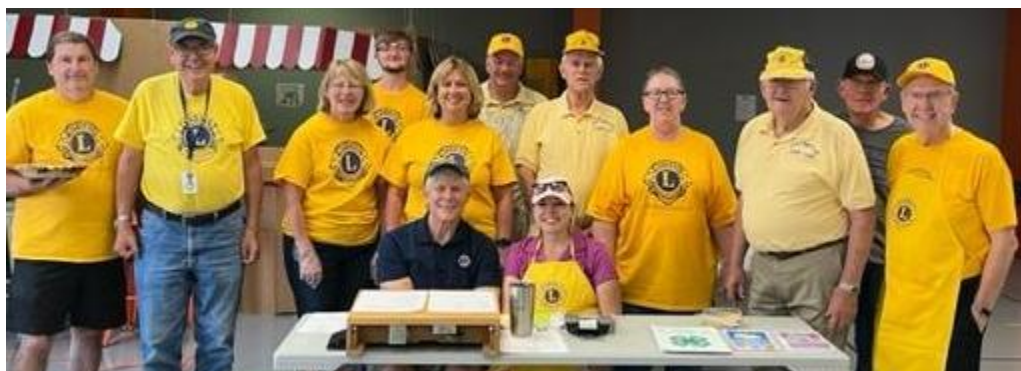
Members of the club who worked the recent 44th annual Lions Club Fish Fry in downtown Centerville June 10th.