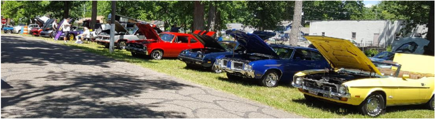
Clermont Car Show. Held June 24th. 134 cars were registered for the show