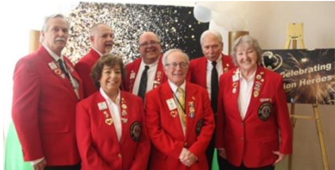
Newly sworn in class of District Governors