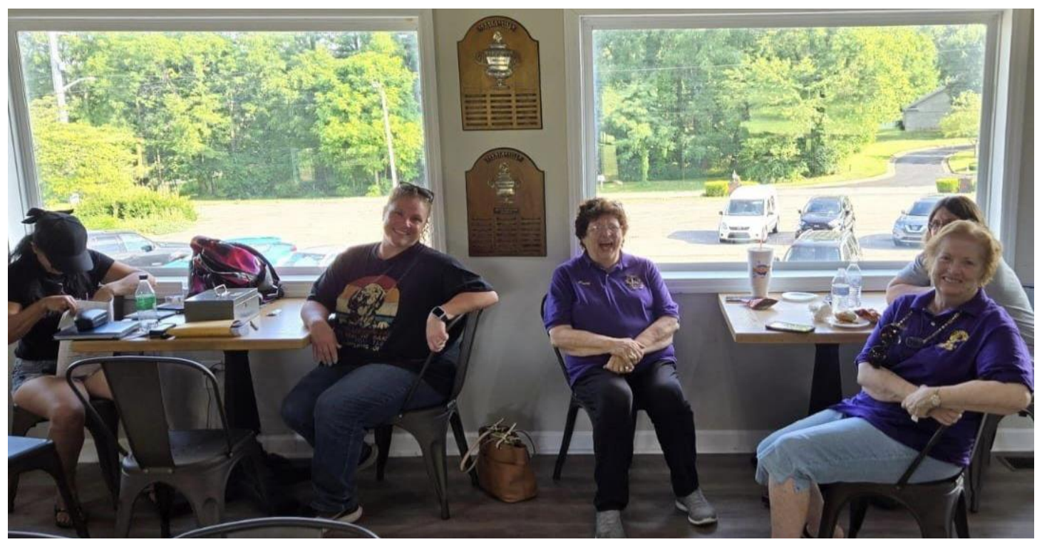
Connersville Lions enjoy time together at their annual Golf Outing on June 22.