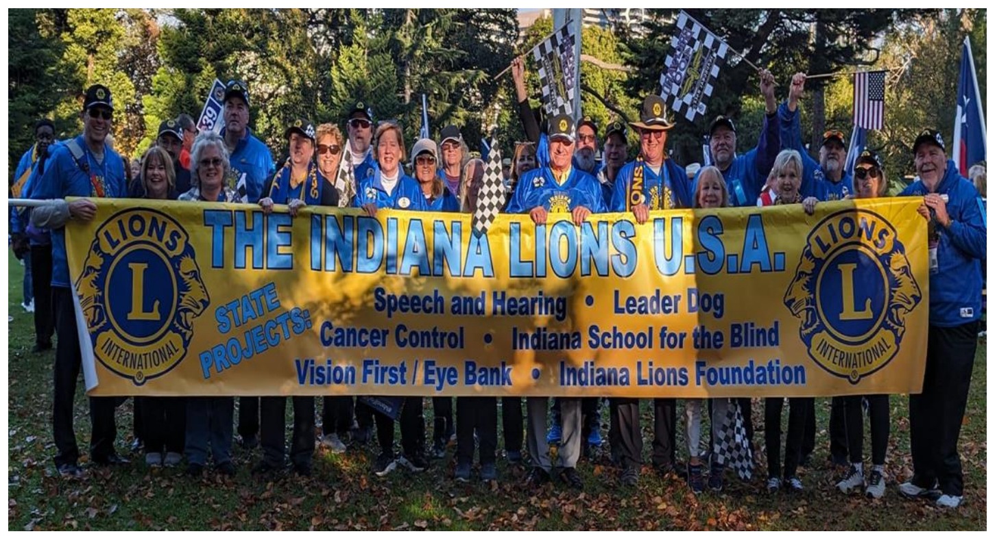
Indiana Lions are ready for the International Parade in Melbourne Australia on a brisk 40 degree morning.