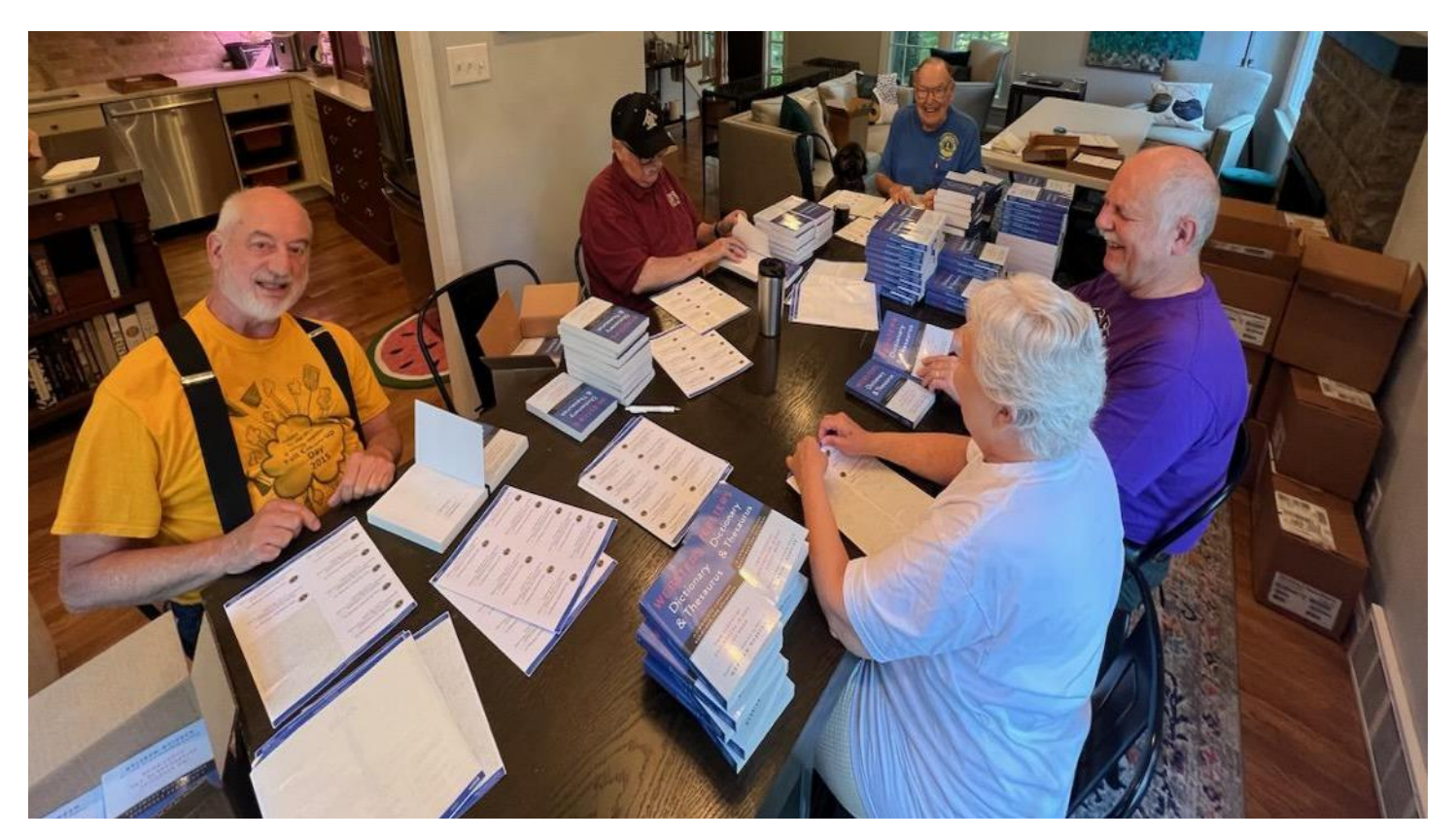
Indianapolis Washington Twp. Lions apply their stickers to the inside cover of the dictionary. Getting them ready to be distributed to the elementary students in their community.