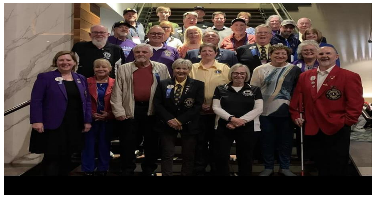
Above: Indiana Lions gather after dinner for a group pic in Melbourne Australia.