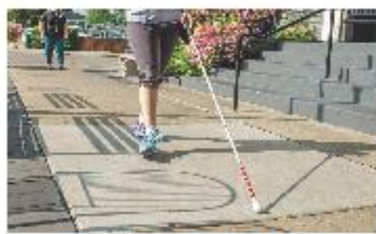
with a Leader Dog