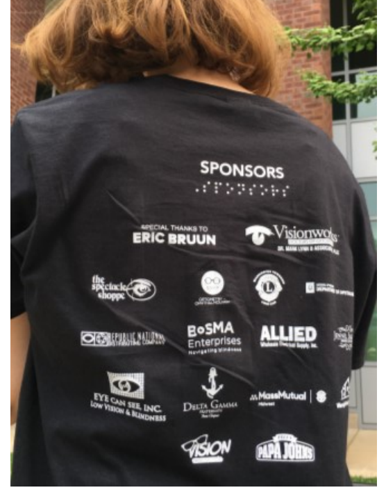
The Indianapolis Washington Township Lions Club was a sponsor of the event. The Lions logo is visible near the middle of the shirt.