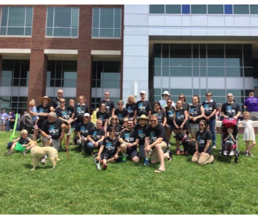
The Indianapolis Washington Township Lions Club participated in the Walk for Dreams on the canal in downtown Indianapolis on May 20. The Lions elected to support VIPS (Visually Impaired Preschool Services) in the event.