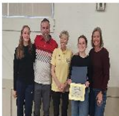
Clermont Lions Scholarship Winners.