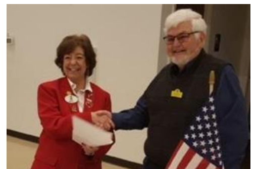
Greenfield Lions Club President presented his Club Donations.