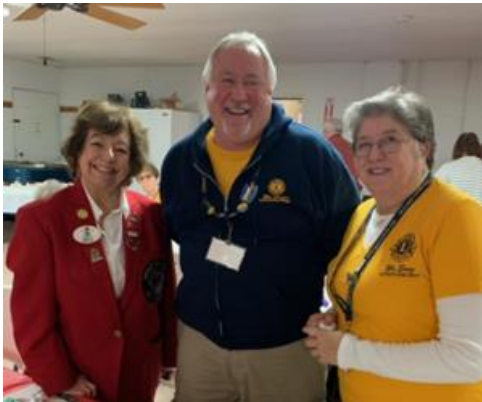
I met Lions from Seal Brach California!