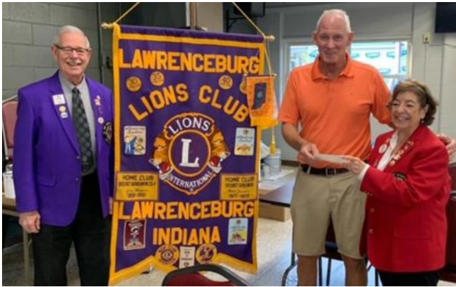
Lawrenceburg Lions donated to the Tornado Relief fund.