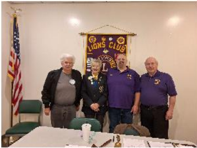
Connersville Lions Club Official Club Visit!