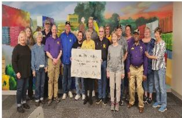
Lions from Chapel Hill, Decatur, Ben Davis, Speedway, Pike & Clermont participated in a Zone Chair Service project at Gleaners Food Bank.