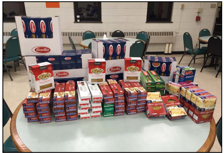
Indy Washington Township Lions Club held a pasta drive on Sept. 26 and donated 187 pounds of pasta to benefit Second Helpings.