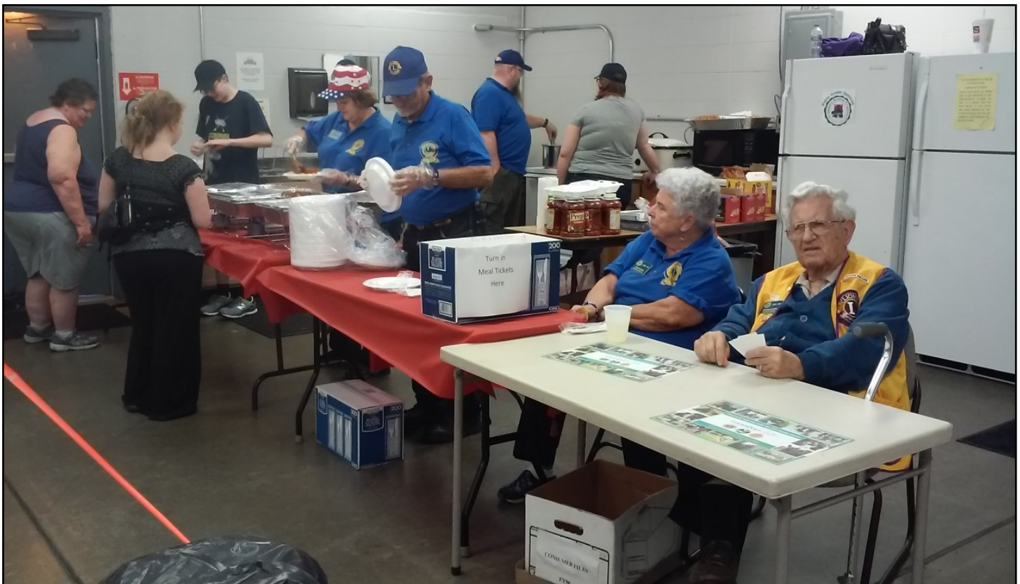
The Lions Club of Southport's Annual Spaghetti Dinner held on October 1st. Monies raised will go to paying for a new mascot costume for the Southport Police Department.