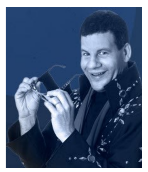
rotten (his words) prizes.

The committee also moved the venue to the Crowne Plaza Hotel & Conference Center, located at the Indianapolis International Airport. All activities will be inside this facility, making it easy for attendees to park and remain there for both Friday and Saturday activities. Changes in fees at the public schools in Plainfield would have increased our fees substantially to use those facilities, plus the meeting rooms and conference areas at the Crowne Plaza are much more accommodating and comfortable for attendees.