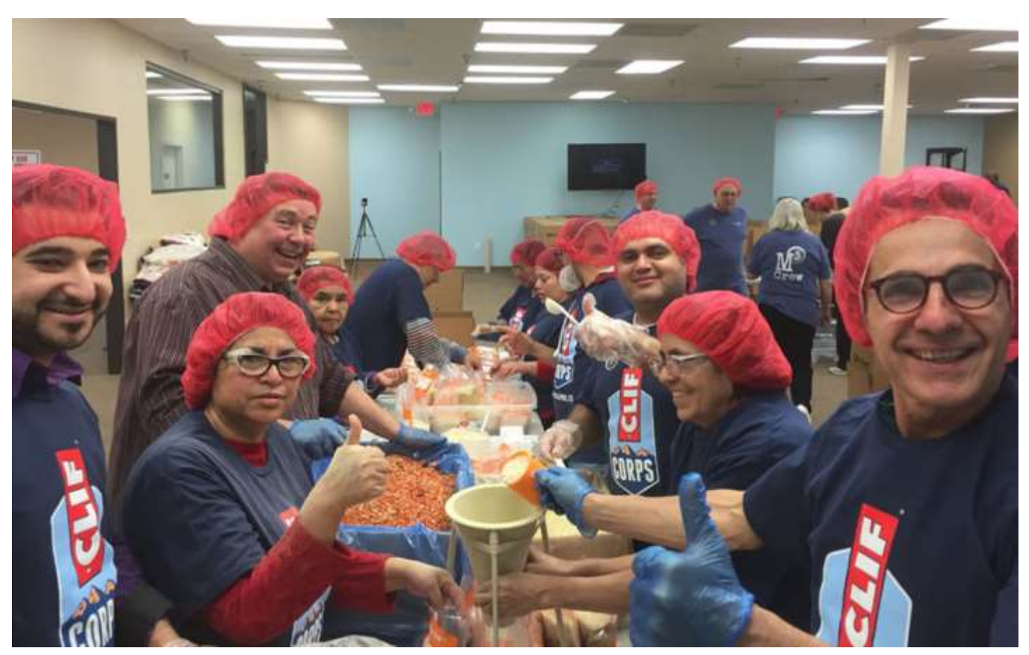
Volunteers are shown at a typical meal preparation area at a MMM project.

Additionally, a seminar session on Saturday, January 11 will feature representatives from the Million Meal Movement who will detail how local Lions clubs can develop partnerships in their own communities. The MMM is an excellent new service project that involves volunteers to meet the needs of over 1 million children and adults throughout Indiana.