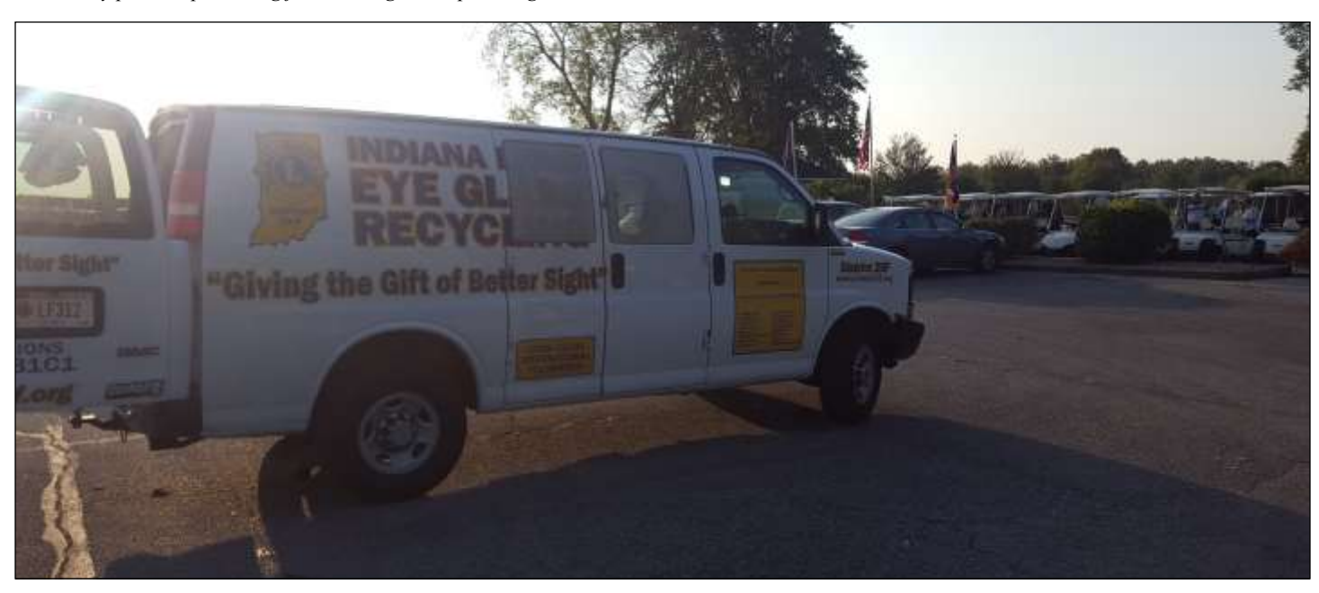
The Vision Van was on display at the Batesville golf outing held on September 21st.