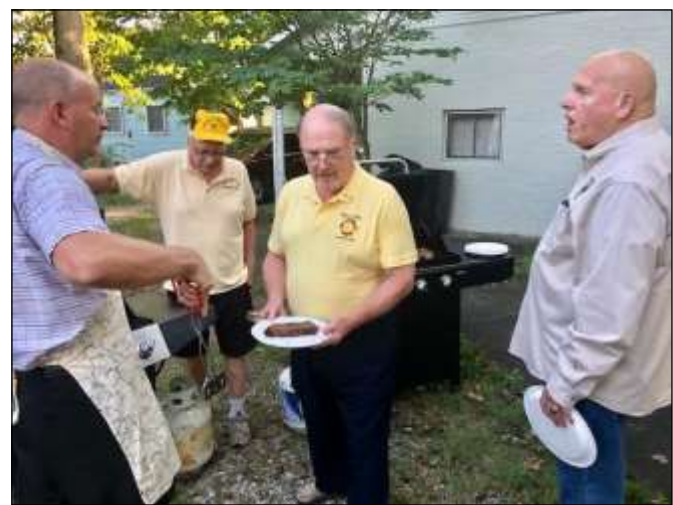
Lions gather to pick out their steaks before the dinner meeting.